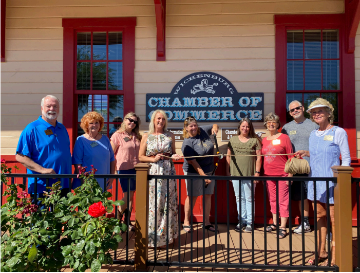
T Shugars BBQ, Tara Baptist Catering 480-650-7543 tshugarsbbq.com